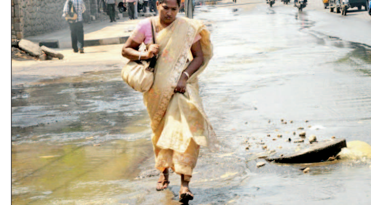
WADING THROUGH SEWAGE: Overflowing sewage on Punjagutta-Khairatabad road resulted in inconveneince for pedestrians and motorists

Mohammed Afsar, PLOT NO 21-4-884, GULABSINGH LANE, PETLABURJ, HYDERABAD