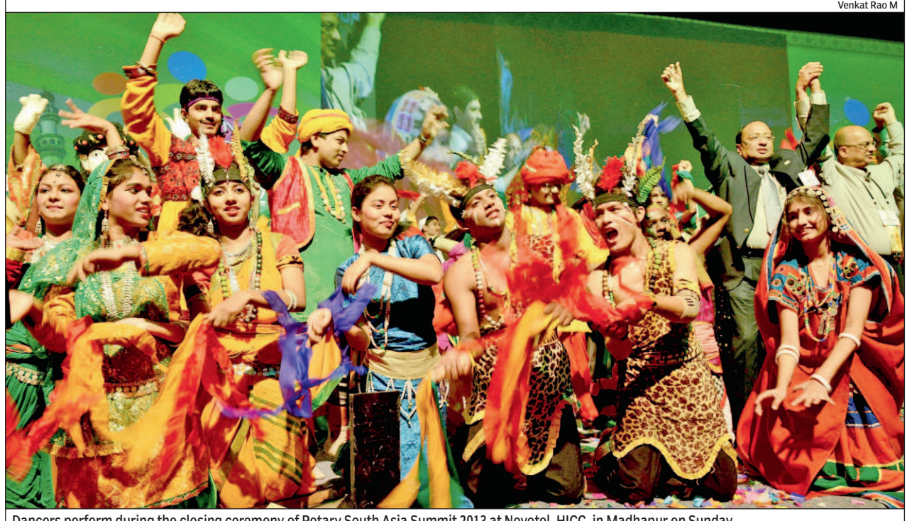
Dancers perform during the closing ceremony of Rotary South Asia Summit 2013 at Novotel, HICC, in Madhapur on Sunday